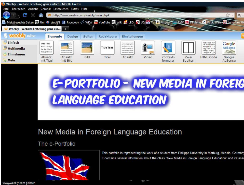
An example for the editor for your personal webpage on “weebly.com”

teaching, because it gives the possibility to upload teaching material for your classes or courses and make it accessible for your students on the web.